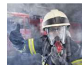
Advance RIT Rescue Training

Hands On Training [8 hours] Date: Saturday, September 16; Registration: 7:00 AM Includes: Light Breakfast and Lunch